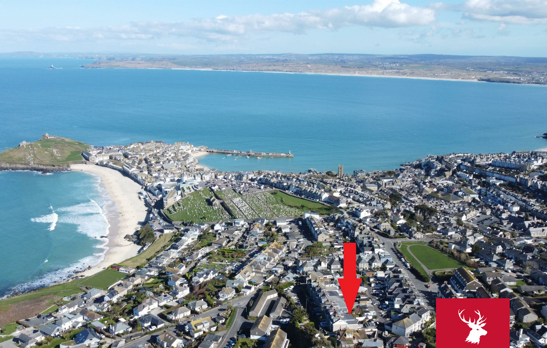
9 Carthew Terrace